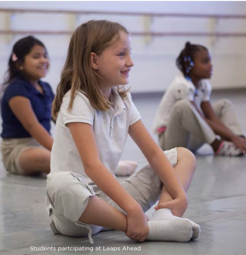
Students participating at Leaps Ahead